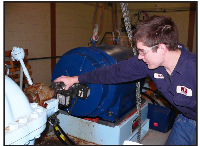
KJ Electric technicians use the Hamar Laser Stealth Series S-680 & Couple 6 Software.